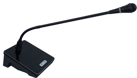
Full Digital Microphone TCI-8502C TCI-8502D